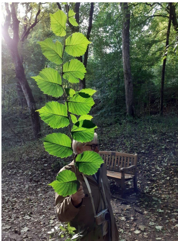
Grin Low Woods visit

Becca's remaining art packs included: contributing to an online 'Corona-quilt' (theme – rituals of everyday); 'Steal their style' (Salomon, Kahlo, Hockney, Warhol, Miro, Dali); Historic buildings; Rousseau's jungle artwork; and Klimt/Art Nouveau. Since September we've tackled Trees, inspired by a