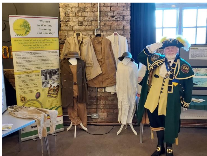
WLA display, Writing Leek event

The Value of Small in a Big crisis, Lloyds Bank Foundation of England and Wales, March 2021 (Most emboldening is original).