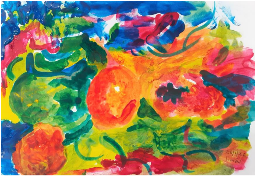
Still life with fruit, Simon. Acrylic applied with fingers