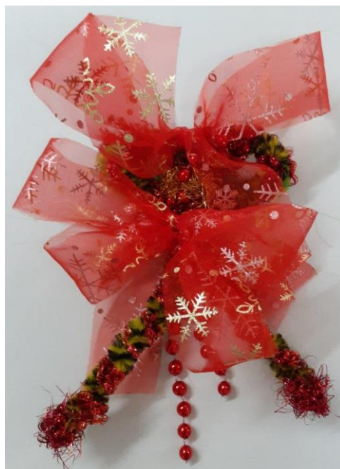
Xmas decoration, Tia. Mixed media

Two edited extracts offer some context. The first is from a research digest commissioned by the Lloyds