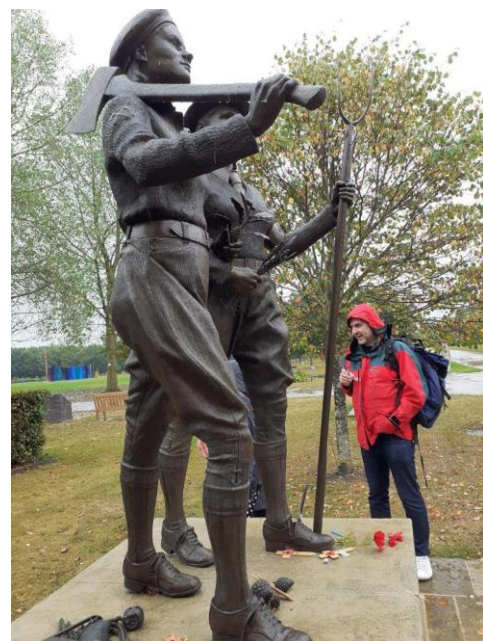
Women's Land Army memorial visit