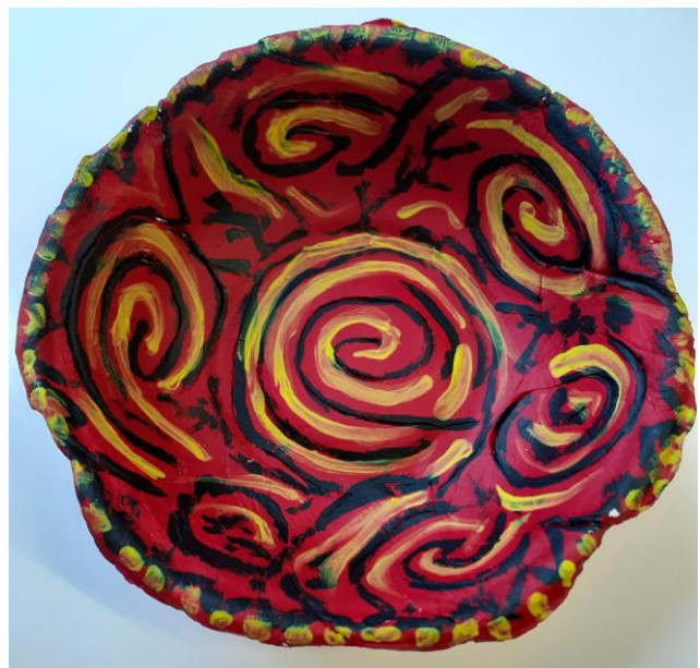
Coil pot, Tia