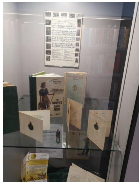
WLA display Leek Library