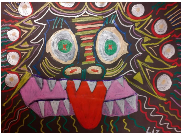
Chinese New Year, Liz. Mixed media

participants were relieved to come to our new home for writing, art, drinks, biscuits and the supportive, informal conversation which is integral to BV activities. Many participants continue generously to make weekly voluntary donations to support sessions. A suitable room is available only 1 day/week, which also means setting up beforehand and clearing everything at the end of the day.