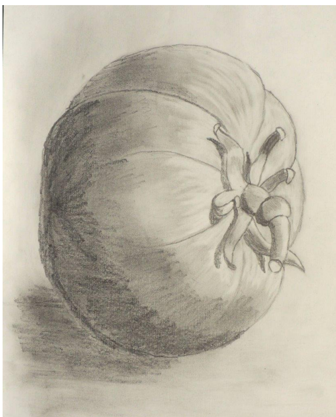
Crop study, Will. Pencil