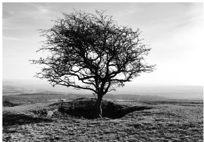
Solitary tree, Mark. Photograph

Non-medical referrals such as befriending services, practical information including benefits and financial advice, community activities, arts and culture and physical activities, and those that take place in nature can alleviate issues relating to loneliness, stress, mild to moderate depression, and anxiety.