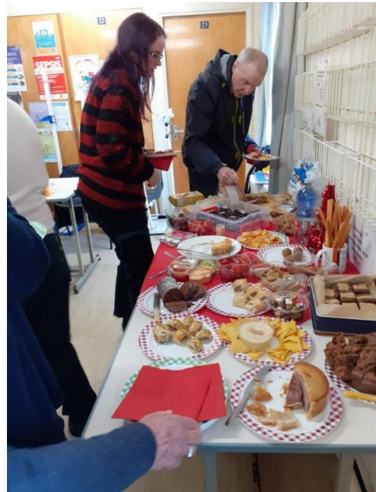
Bring and share Christmas lunch at LHC

I take the steps, trusting these new words, reaching closer to the top. The nasty evil thoughts that cloud this place begin to whirl around,